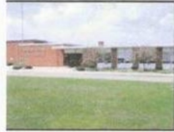
Fredericktown High School

Recreation Department have light sticks for the children so they will be seen. It is a community that enjoys being small with the luxury of larger communities within 45 minutes for a larger variety of entertainment.