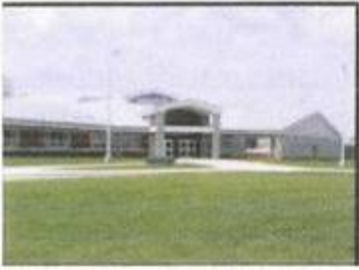
Fredericktown Primary Building