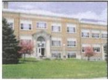
Fredericktown Intermediate School